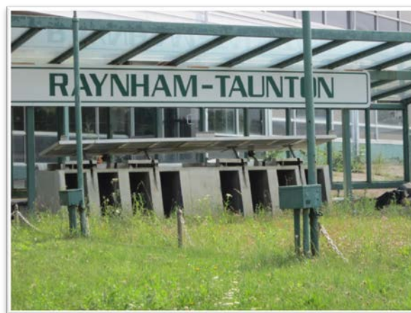
Raynham Park ceased live racing on December 19, 2009

Twin River – ceased live racing on August 8, 2009