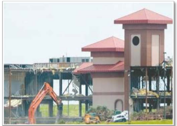
Geneva Lakes Kennel Club demolition, 2014