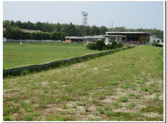
Raynham Park closed in 2010 after Massachusetts voters outlawed dog racing.

Greyhound racing is a dying industry. This decline is due to increased public awareness that dog racing is cruel and inhumane, in addition to competition from other forms of gambling.