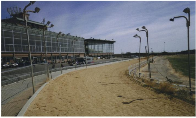
Cloverleaf Greyhound Park, closed 2006

Since 2001, 25 racetracks have closed for live greyhound racing from the West Coast to the East, North and South. As of January 2011, there are only 23 dog tracks remaining in seven states. Read more on our state-by-state information page .