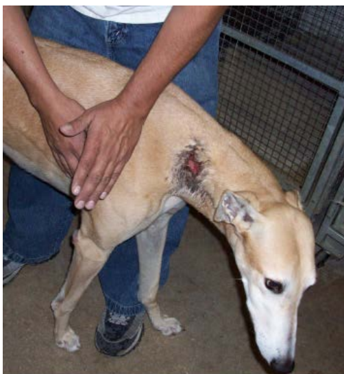
Dooley, an injured greyhound found at Palm Beach Kennel Club. Photograph from the Palm Beach Sheriff's Office, 2009.