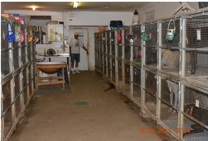
Inside a greyhound kennel at Daytona Beach Kennel Club.

At Florida tracks, greyhounds are kept in warehouse-style kennels in rows of stacked cages, with shredded paper or carpet remnants as bedding. Greyhounds are normally confined in these cages for 20 to 23 hours per day. 1 As many as 8,000 dogs are housed in these conditions. 2