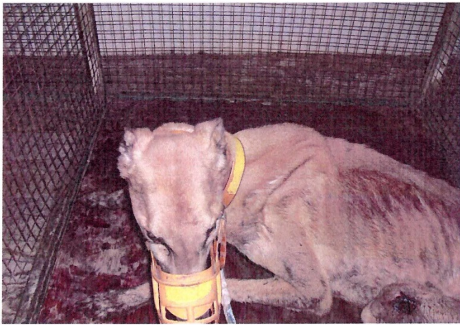
A severely emaciated greyhound that was discovered in a kennel at Ebro Greyhound Park. Photograph by the Florida Department of Business and Professional Regulation, 2010.

the dogs had silver duct tape wrapped around their necks. 24 The tape was wrapped so tightly that it could not be cut off and had to be unwrapped. 25 A necropsy later determined that the greyhounds died from dehydration or starvation. 26