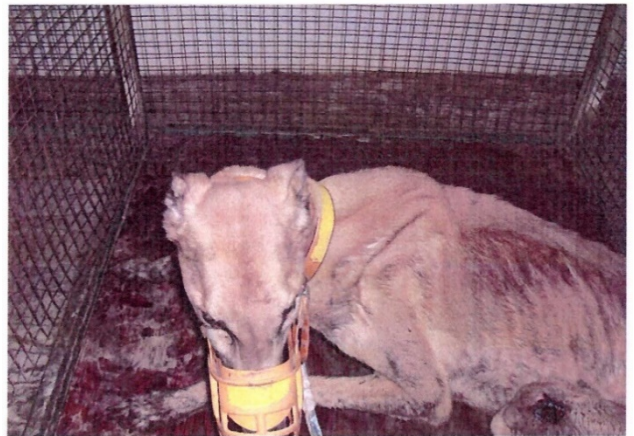
A severely emaciated greyhound that was discovered in a kennel at Ebro Greyhound Park.