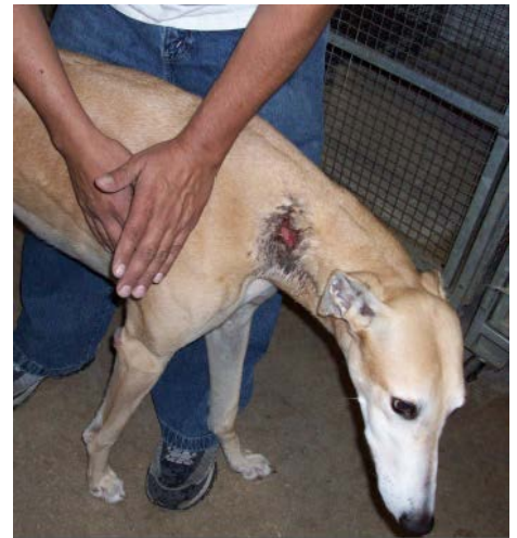
Dooley, an injured greyhound found at Palm Beach Kennel Club.