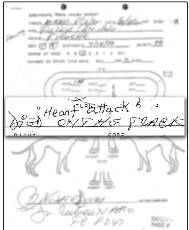
Track injury report for Fuzzys San Jose, who died after suffering a heart attack at Flagler on June 4, 2011.