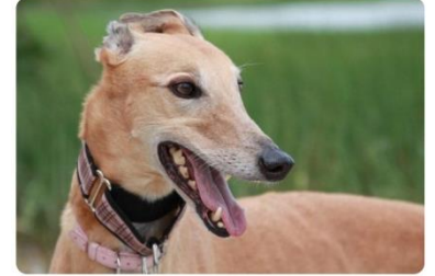
Sweetie Pie of FL

Wagers and taxes collected from greyhound racing in Florida have dramatically declined from 1990 to 2016, yet state mandates require the number of live performances to remain steady.