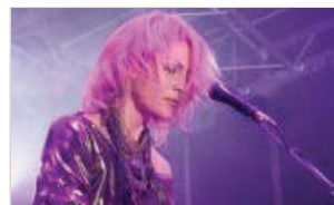
Metric at Art Loves Music