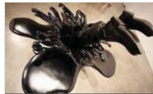
Art Basel Miami Beach 2010 at Miami Beach Convention Center