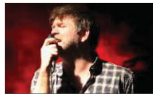
MOCA Los Angeles Beach Party with LCD Soundsystem at the Raleigh