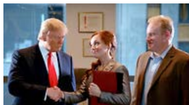
THUMBS DOWN: A spot for Century 21 that featured Donald Trump.