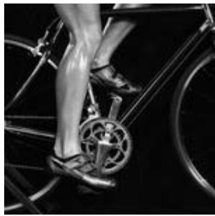
How 1-Minute Intervals Can Improve Health