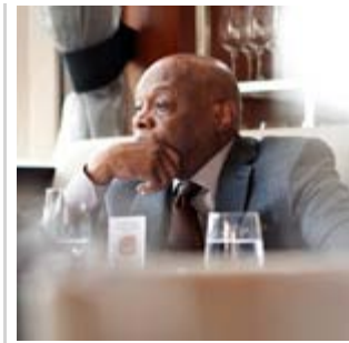
Out of Office, but Not Out of Things to Say

Home | World | U.S. | N.Y. / Region | Business | Technology | Science | Health | Sports | Opinion | Arts | Style | Travel | Jobs | Real Estate | Autos | Site Map