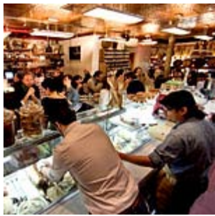
Five Dishes at Il Buco Alimentari e Vineria