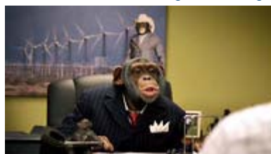
THUMBS DOWN: A CareerBuilder ad that brought back its chimps dressed as humans.

Too many commercials fell back on tactics that were too familiar from a plethora of Super Bowl spots: anthropomorphic animals, second-class celebrities, slapstick violence and riding the coattails of popular culture. Risk-taking, rule-breaking ideas were as hard to find among the more than 50 commercials as good taste in a GoDaddy ad.