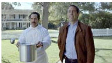
THUMBS UP: Jerry Seinfeld and the "Soup Nazi" promoted Acura.