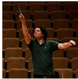
Mahler Is O.K., but Gustavo, He's Amazing