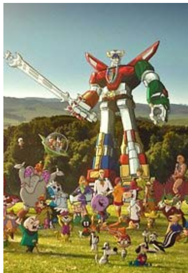
THUMBS UP: A MetLife commercial joined 56 cartoon characters with the usual “Peanuts” gang.

METLIFE A charming commercial finally provided the “Peanuts” gang, who have been peddling MetLife for decades, with some company: 56 characters from the inkwells of