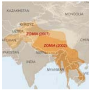
Borderlines: The Undiscovered Country