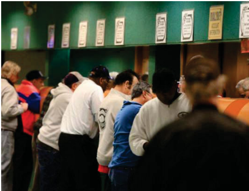
People lined up to place their bets during one of the afternoon dog races recently in Raynham.

Voters spoke, so Raynham to end dog racing today