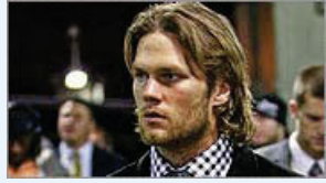
The evolving hairstyle of the Patriots quarterback