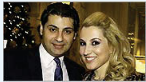
The Mistletoe Ball in Boston, and more local events