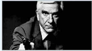
Leslie Nielsen and others who passed away