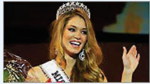
Meet our new Miss Massachusetts USA