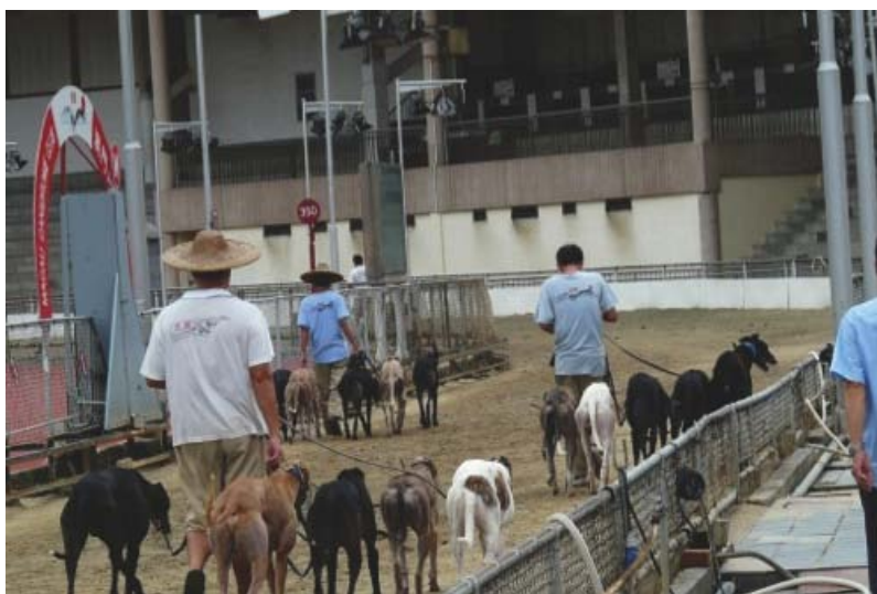
Grey2K is putting pressure on Canberra to halt greyhounds' exports from Australia to Macau