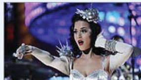
Scenes from the live Grammy Awards nomination show