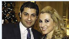
The Mistletoe Ball in Boston, and more local events