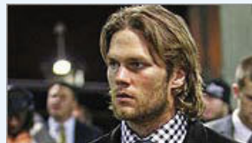
The evolving hairstyle of the Patriots quarterback