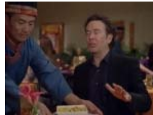
Groupon "Tibet" (Timothy Hutton)