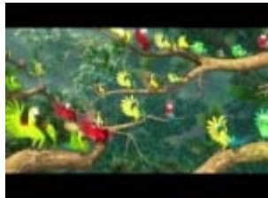
Trailer for "Rio"